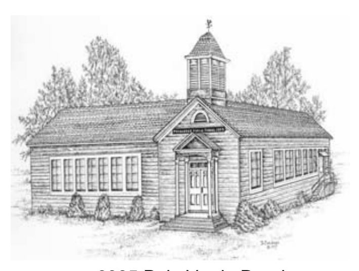
6395 Palo Verde Road Castro Valley, CA 94552

Office Phone: 510-582-4207 FAX: 510-582-3948 Attendance Reporting: 510-537-4207